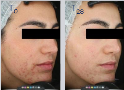
STD2 Standard 2

In vivo visible reduction of blemishes and inflammatory acne lesions combined with antimicrobial activity against pro-acne bacteria.