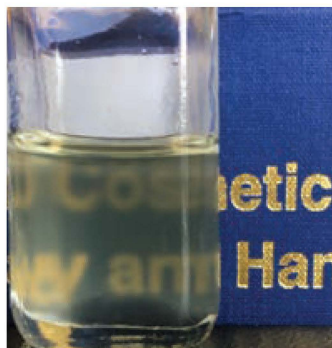
SurfaCare® S in Olive Oil at 20 wt %.